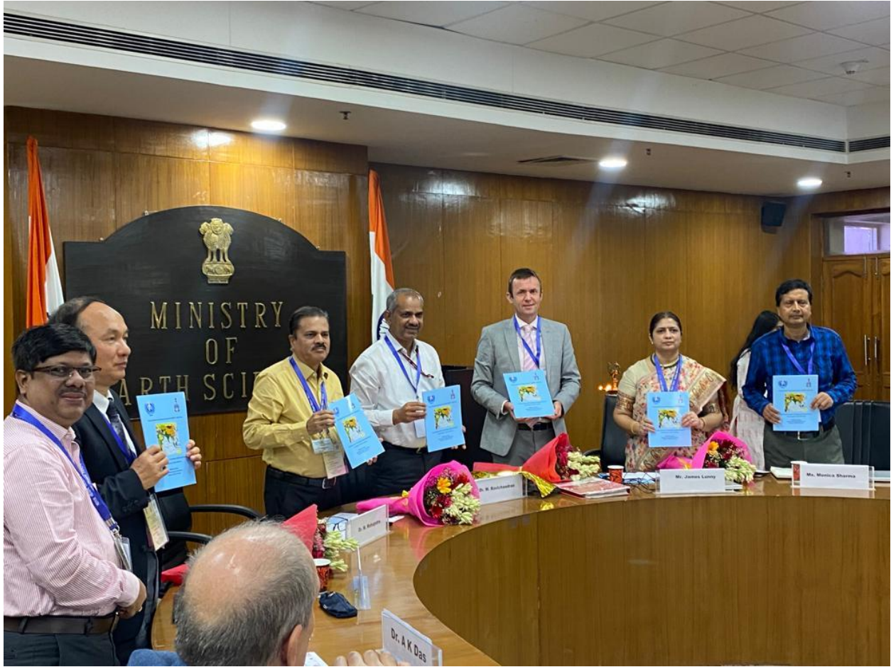
Release of report on “Severe Weather Forecasting Programme- South Asia” by Secretary, MoES, DG, IMD and other delegates.