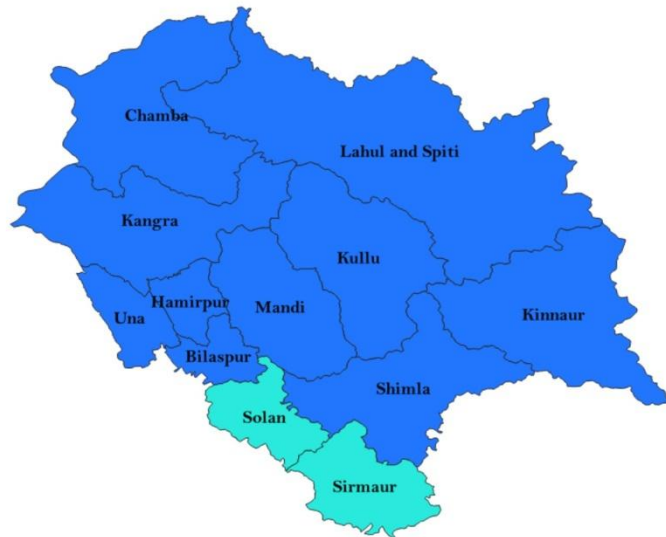
DAY 3(UPTO 0830 IST OF 16.03.2025)