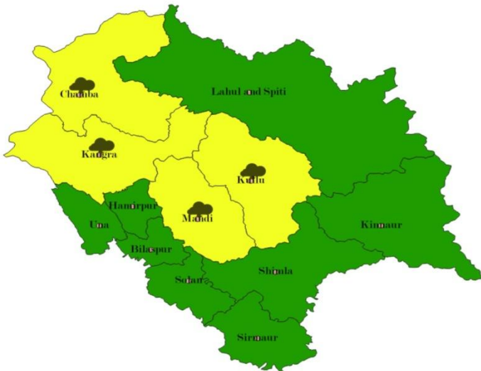
DAY 2(UPTO 0830 IST OF 15.03.2025)