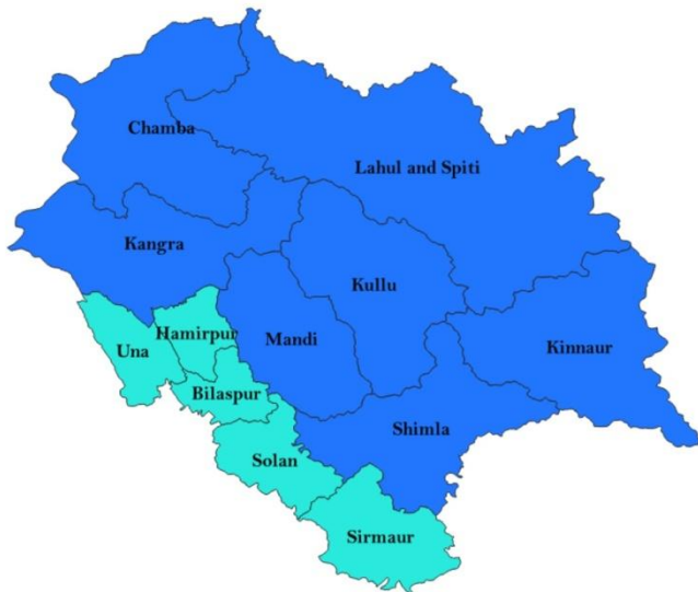
DAY 4(UPTO 0830 IST OF 17.03.2025)