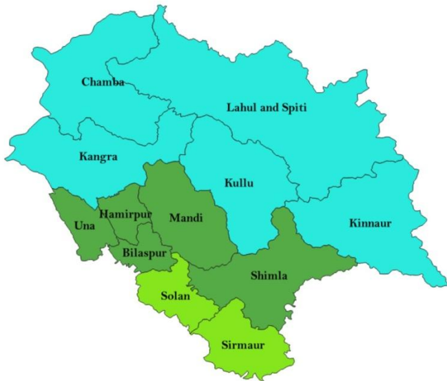
DAY 2(UPTO 0830 IST OF 15.03.2025)