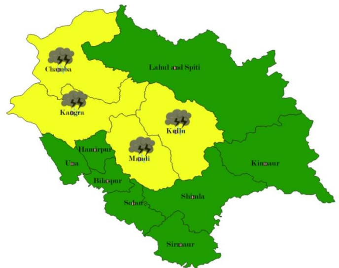
DAY 5(UPTO 0830 IST OF 18.03.2025)