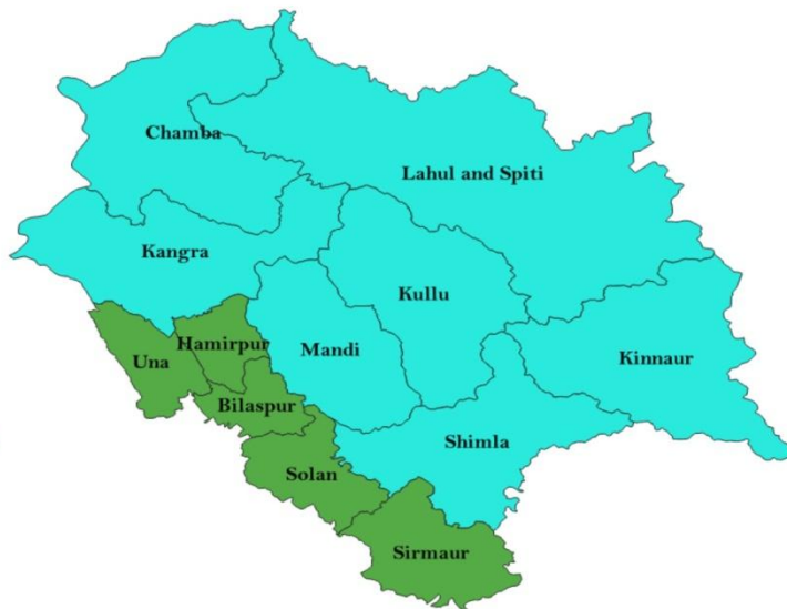
DAY 5(UPTO 0830 IST OF 18.03.2025)