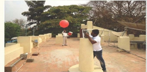
Press and Media Briefing