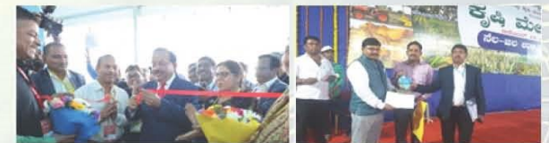
Climatology of Bengaluru